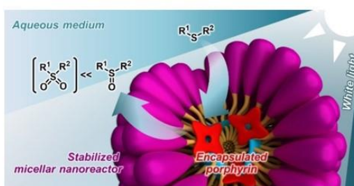
Figure 2 : Semi-heterogeneous photocatalytic system for chemical neutralization of sulfur mustard